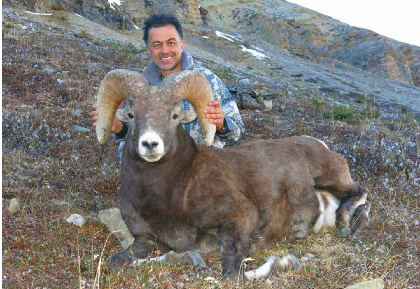
Here it is, the “royal” game!