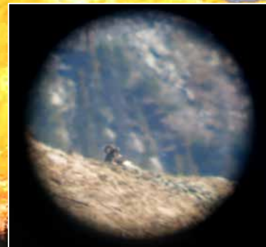
...we noticed a critter bedded on an impossible knoll some three kilometers away.