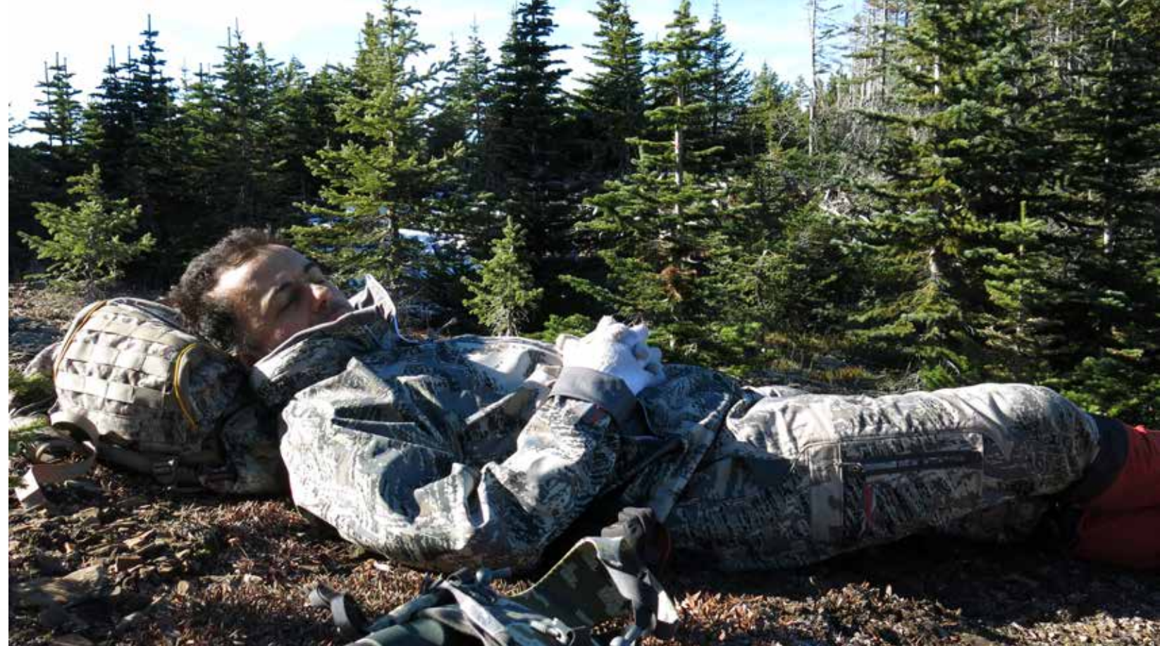
Yours truly taking a “Mountain Siesta”.

Leupold AR tube in 3-9x40. It shoots my favorite 150-grain Swift Scirocco bullets at a sizzling velocity of 3,250 fps out of its 25” pipe and prints little bug holes on a consistent basis. When I built it, I was to prove to my 7mm RM aficionado buddies that I can equal (and in this case exceed) their performance out of a standard 30-06 beltless offering.